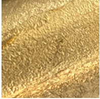
Gold Leaf - GLF